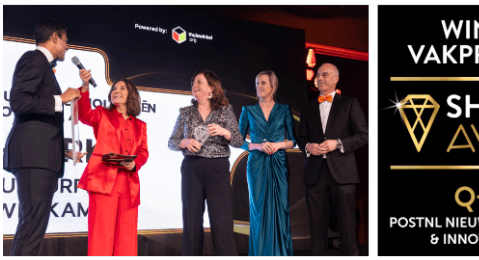
Figure 4: Dutch team wins Shopping Award

Q-Park Netherlands received the Dutch Shopping Award prize for its digital transformation of parking. These Shopping Awards are the most important awards for retail and e-commerce in the Netherlands. In selecting Q-Park, the jury of professionals commended the organisation saying: "The winner has been bold to do things completely differently."