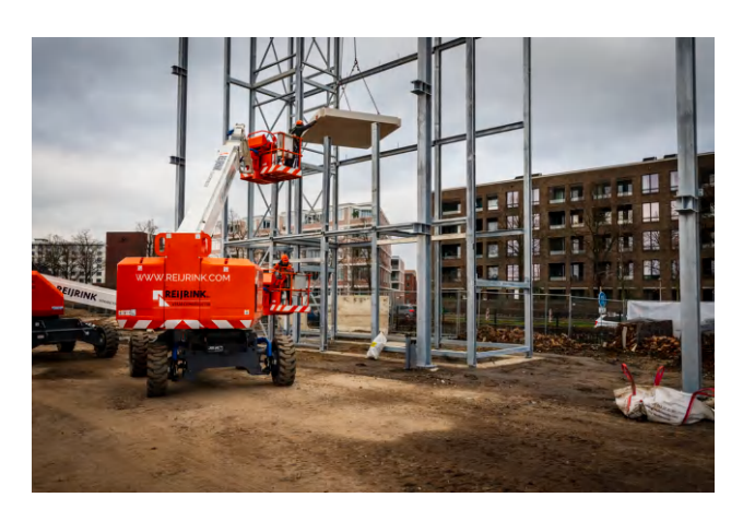
Figure 5: Assembling the prefabricated elements

As the grid capacity available is insufficient to power the parking facility's lighting, ventilation, and equipment systems as well as EV charging points, a creative energy management system has been installed with sufficient energy for all needs. This includes: