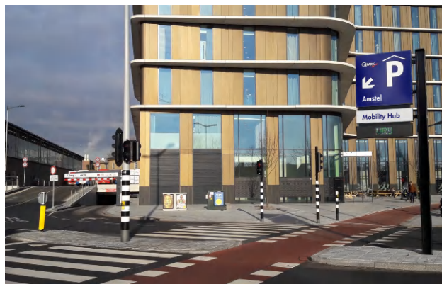
Figure 11: Easy to recognise for pedestrians